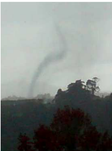
TWISTER : A tornado ripped through Warkworth Police have been evacuating the Bayfair Shopping Centre in Tauranga as the severe weather hits. They said the centre was flooding. A spokesman at the Tauranga Fire Station said there had been "extensive damage" to the mall.