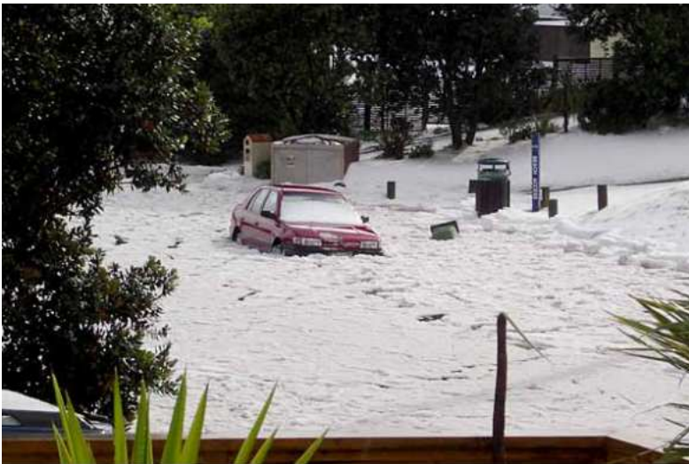
BURIED in hail: corner of Concord Ave and Oceanbeach Rd, Papamoa